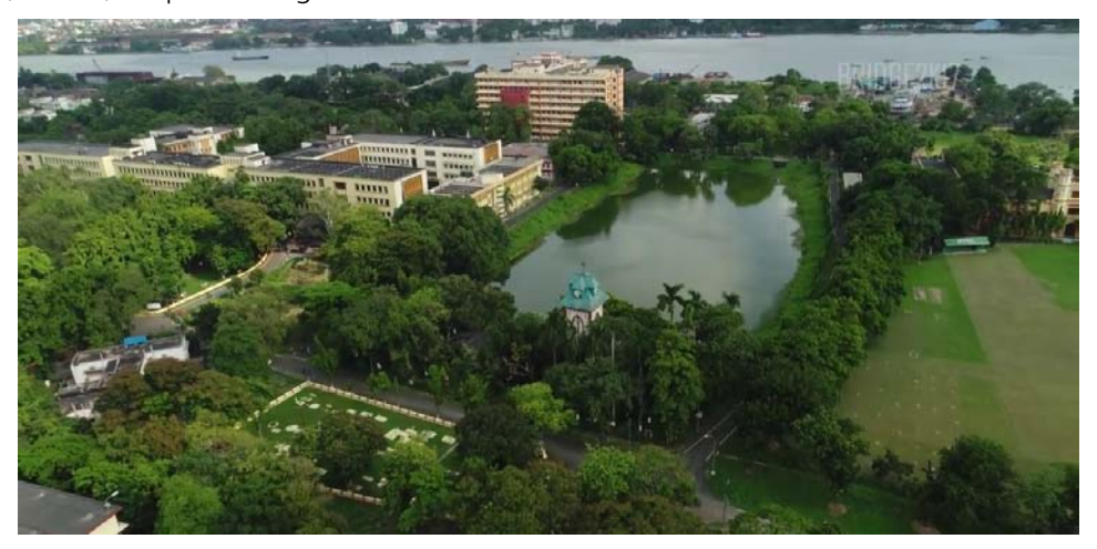
Main Academic and Acharya SN Bose Building

The Institute has a beautiful green campus covering an area of about 49hectares situated on the bank of the river Hooghly. It is located next to the AJC Bose Indian Botanical Garden and opposite to the KolkataPort. The campus has a number of academic and administrative buildings, library, accommodations forstaffs and students, guest house, auditorium, swimming pool, students' amenities, banks, school, hospitals and general services.